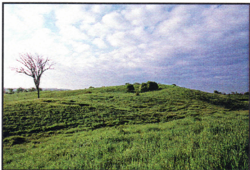
Hidden Prairie Golf Club